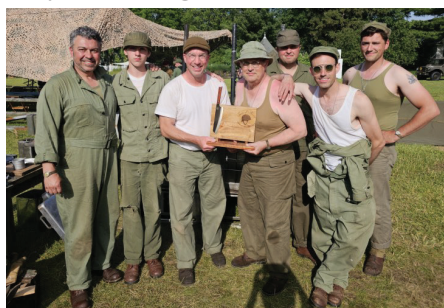
People's Choice WWII Field Kitchen, The Tri-State Living History Association