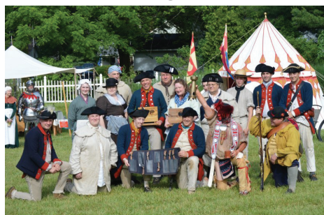
Overall Champion and Best Taste Revolutionary War, 13th Virginia, West August Battalion

Congratulations to the following Field Kitchens and Display winners: