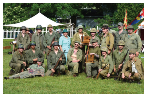
Best Display and Reenactors' Choice World War II Okinawa, Midwest Raiders and 4th Marines & 165 Infantry Regiment, 27th Infantry Division reenactors