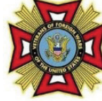
The Friendly Post