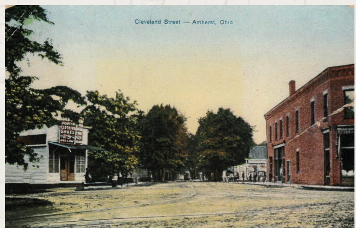
Cleveland Street — Amherst, Ohio