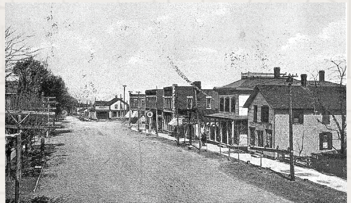
SOUTH MAIN STREET, LOOKING NORTH -1895

The next time you stop by the Five Corners Pure Station to fuel up, grab a bag of ice, or pour yourself a cup of fresh-brewed coffee, consider that you are a part of the most recent chapter in this long story of downtown Amherst's best-known intersection.