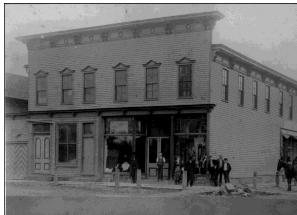
Plato Bros. S.E. Corner Church & Park Destroyed by Fire in 1899