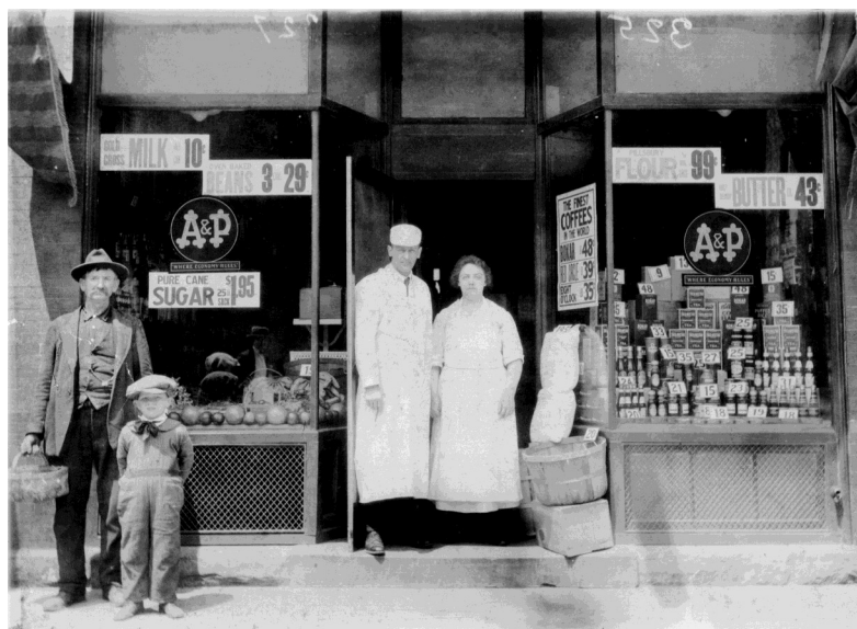
A&P Corner of Church and Park 1950