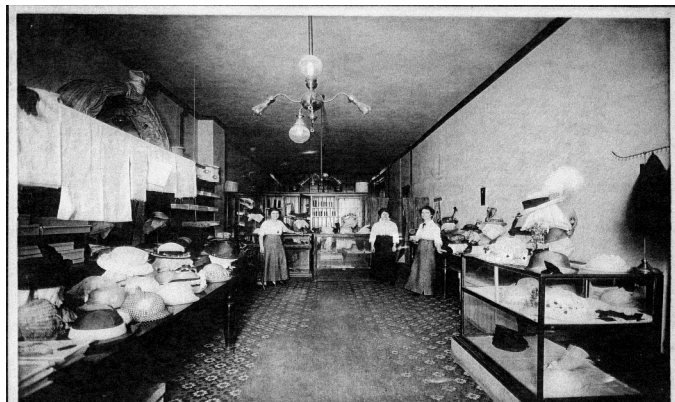
Parsons—Young Millinery Shop 223 Park Ave. 1914