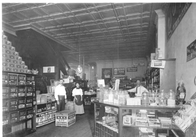
Bodmann's Grocery and Dry Goods 1900